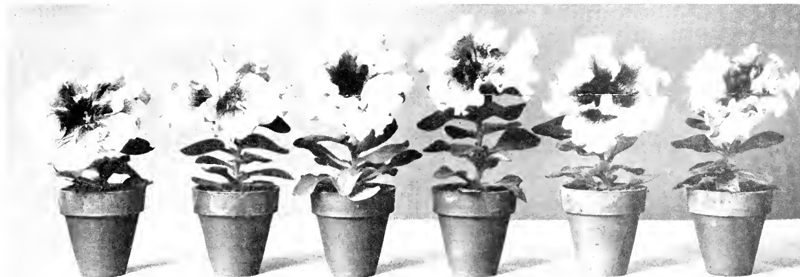
No. 1 Diener's Ruffled Monsters in 3-inch pots, 12 weeks after sowing